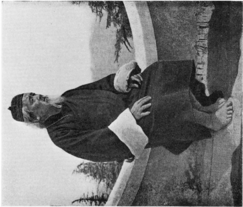
KINTHUP [From 'Records, Survey of India,' vol. 4]